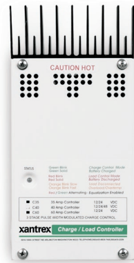
C40 & C60